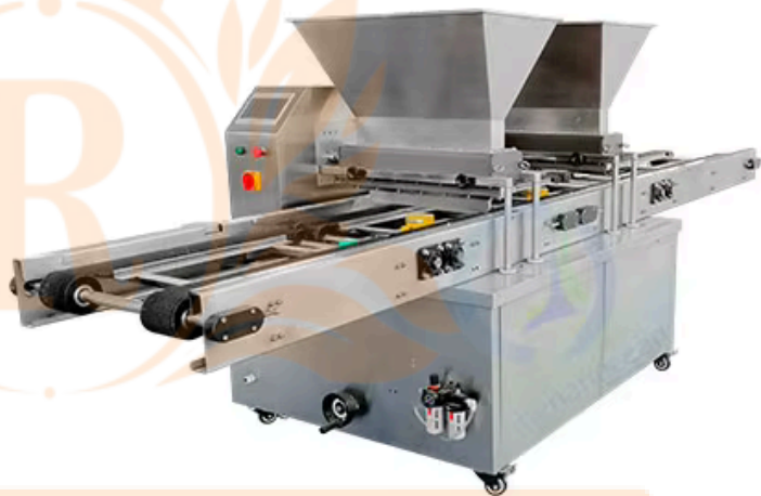
PLC dual barrel style