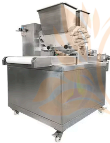
Two color style