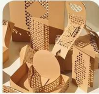
Cut kraft paper