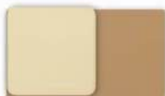
Wood chips * 3 kraft paper * 10