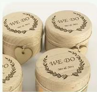
Wooden ring box