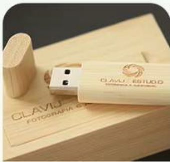
Wooden USB flash disk