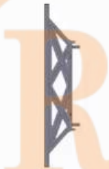
Bracket * 2