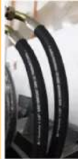
OIL HOSE KIMBERLER —GERMANY