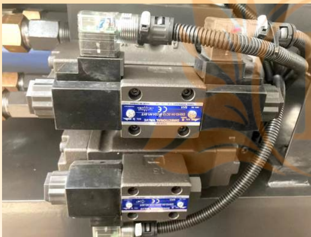
Reversing Valve YUKEN-JAPAN