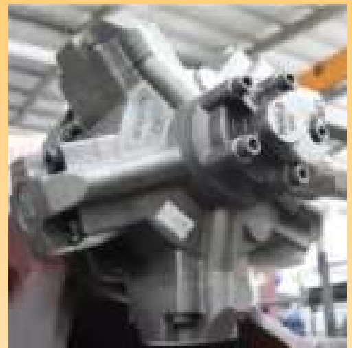
Hydraulic Motor ZY—ITALY