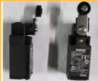
Limit Switch OMRON-JAPAN