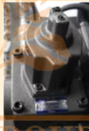
PROPORTIONAL VALVE YUKEN-JAPAN