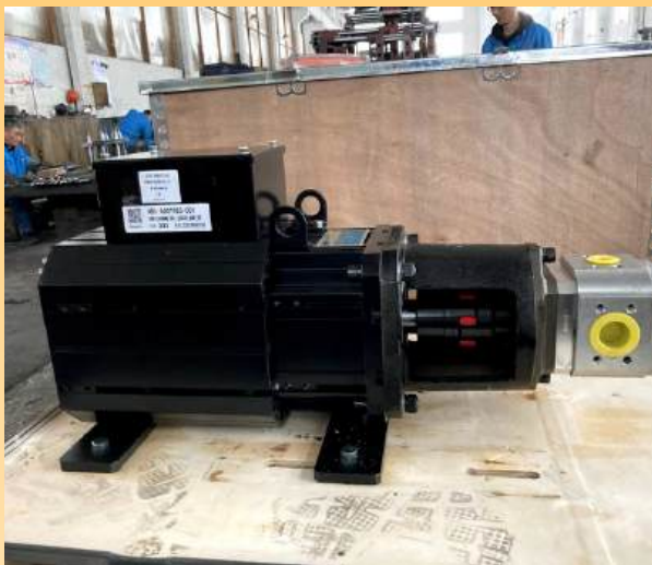
Servo Motor PHASE—ITALY