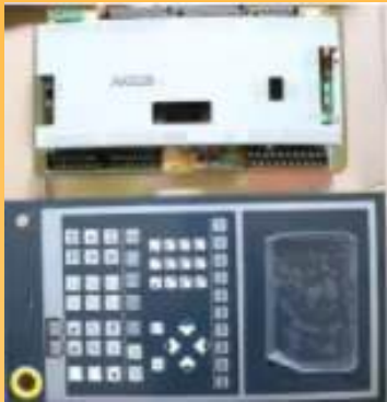
COMPUTER TECHMATION —TAIWAN