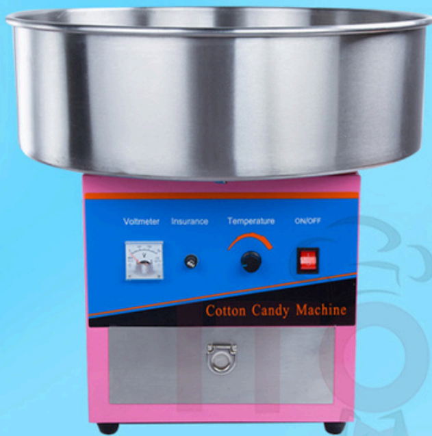
① Electric style