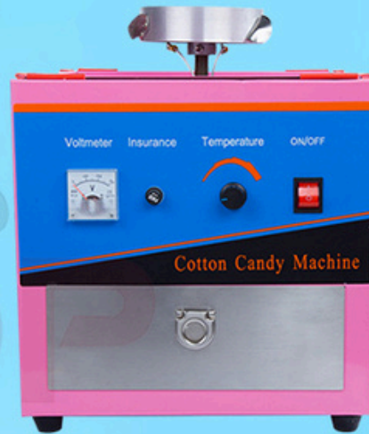
② Electric and gas dual-use style