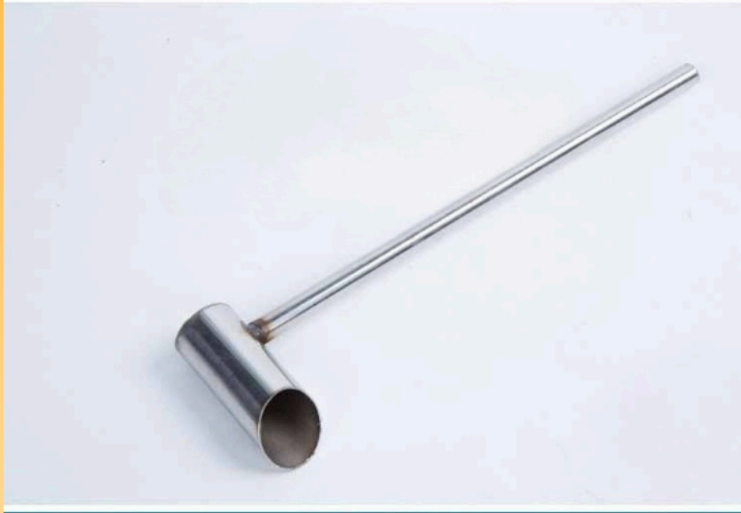
Detachable sugar tray

Distribution of stainless steel sugar spoon, convenient and practical