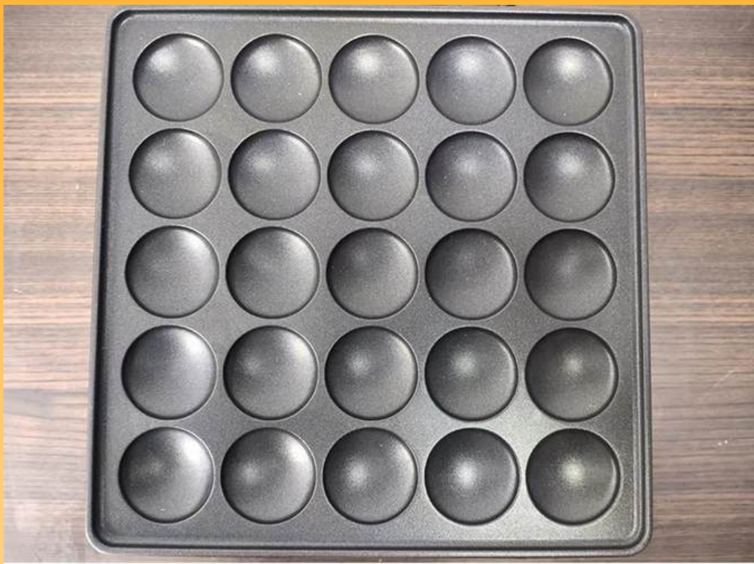
plate size : 26*26 cm with non-stick coating